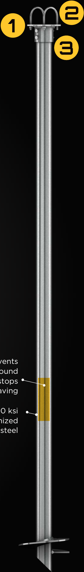
Polyurethane prevents freezing ground around helix and stops winter heaving